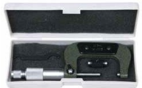
MEAM-W1508 | 0 - 1"