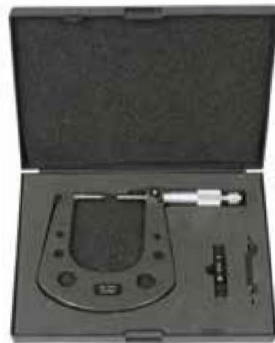
MEAB-W1519 | 7.6mm - 33mm