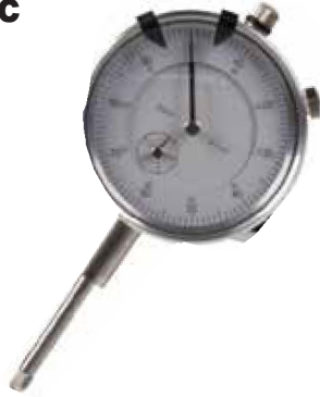
MEAD-W1522 | 10mm x 0.01mm