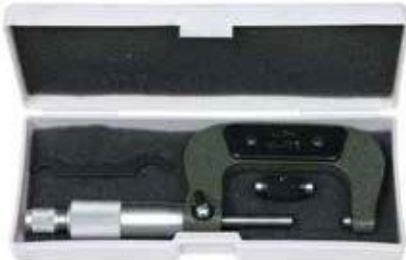
MEAM-W1510 | 0 - 25mm