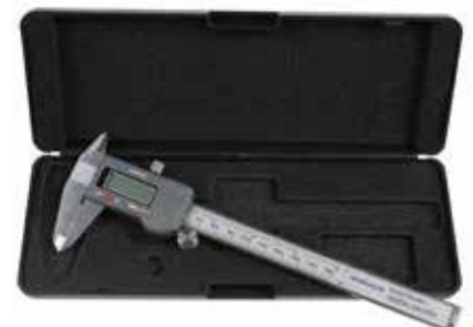
MEAC-W1504 | 6"