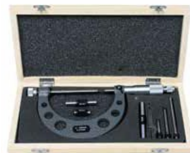
MEAM-W1514 | 0 - 100mm