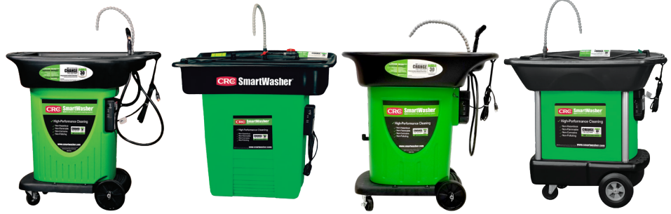
SW-23 Mobile Parts/Brake Washer